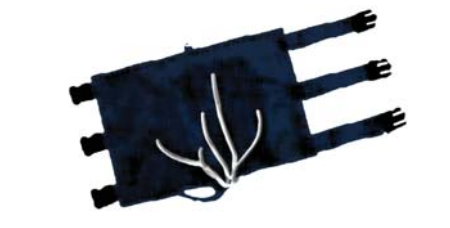
ABDOMINAL MODEL WITH 5 COMPARTMENTS 56 X 37 CM