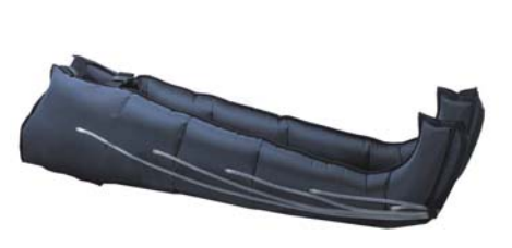
BOOT MODEL WITH 5 COMPARTMENTS 80 X 92 CM