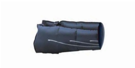
CUFF MODEL WITH 5 COMPARTMENTS 58 X 77 CM